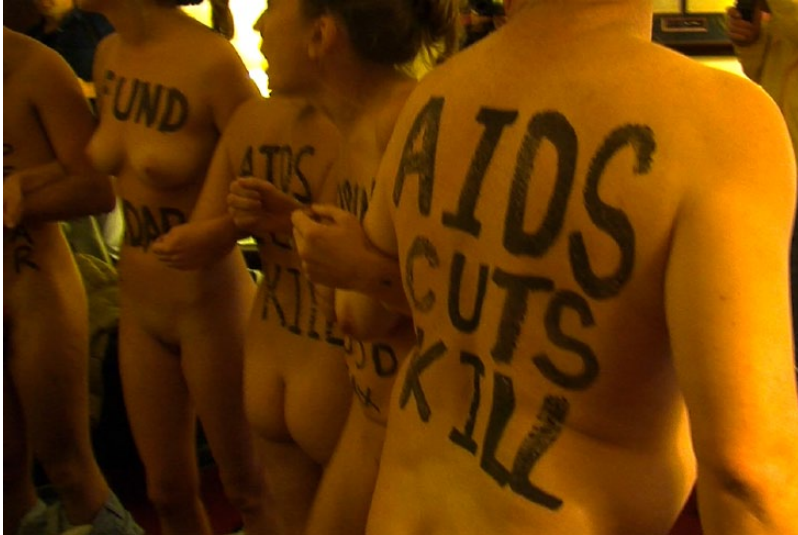
Figure 1 On 27 November 2012, members of QUEEROCRACY held a naked action inside the Washington DC office of Speaker of the House, Rep. John Boehner to expose the ‘naked truth’ about what budget cuts would mean for AIDS programs. Cuts to HIV/AIDS funding would strip people living with HIV/AIDS from essential programs and services that many need to survive and 350,000 people with AIDS will be denied live-saving treatments.

As queer young folk, Queerocracy feels responsible for promoting sexual health on positive and informed terms rather than on ignorance. While the focus of most HIV/AIDS activism has shifted to providing access to drugs and treatment in developing countries, attention to criminalization in the United States, they believe, is key to tackling legally supported forms of discrimination. These activists consider HIV/AIDS criminalization to be one of the most pressing social issues of their time. They belong to a time that has not known sex separate from the risk of infection, yet they profoundly acknowledge a generation of people who experienced HIV as a continual matter of life and death. Now that death is not as prevalent, Queerocracy is shifting the conversation of HIV/AIDS as it relates to the criminal justice system and the silence over HIV as a pressing issue within the mainstream LGBTI movement.