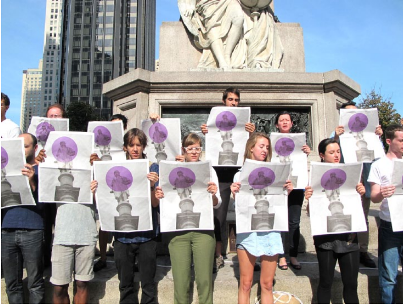
Figure 4 Documentation of A New Discovery: Queer Immigration in Perspective , a collaborative project by Carlos Motta and QUEEROCRACY commissioned by Risk + Reward, a program of the Museum of Art and Design in New York. This project was a social intervention-based performance held on Columbus Day, 10 October 2011, at Columbus Circle in New York City. The group collectively read excerpts of a timeline they created titled A Timeline of Queer Immigration . © Carlos Motta.

first settler-immigrant to neglect the lives of queer and other indigenous people in the Americas. With Camilo and Cassidy, we compiled A Timeline of Queer Migration , a poster that lists some of the most important moments concerning queer migrations internationally. We wanted to create a context for discussion of the perverse ways in which immigration authorities have severely policed queer migrants' lives, and for speaking about how the rights of undocumented migrants are often excluded from conversations surrounding justice for LGBTI people. We borrowed the form of the 'human mic' used by Occupy Wall Street and trusted that the presence and mass of our bodies, and the sound of our voices, would disrupt Columbus Day celebrations by implicating the explorer within a history of violent discrimination.